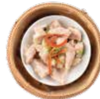
DS6 芋头蒸排骨 $4 Steamed Pork Ribs with Yam