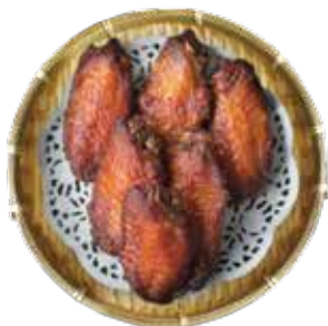
SB2 广东虾酱鸡中翅 Cantonese Shrimp Paste Chicken _ $8