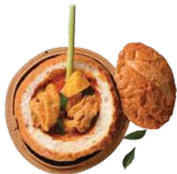
SB3 海南咖喱鸡面包碗 Hainanese Curry Chicken Bread Bowl _ $8