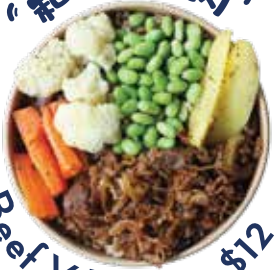
Beef Yakiniku $12

Sauteed yakiniku tender beef with sliced onions