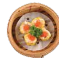
DS7 烧卖 $4 Steamed Siew Mai