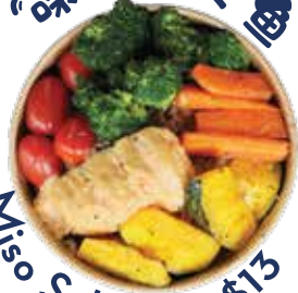
Miso Salmon $13

Roasted salmon fillet with home-made miso sauce