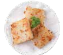
DS4 腊味萝卜糕 $4 Pan Fried Carrot Cake