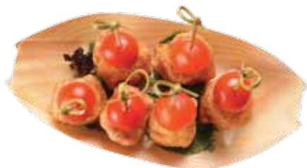
SB1 福建虾卷 Hokkien Prawn Dumpling _ $6