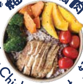
Yuzu Chicken Breast $12

Slow-cooked chicken breast with yuzu dressing