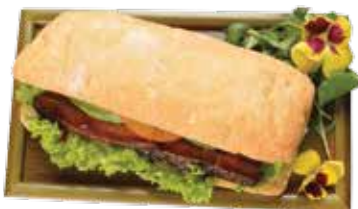
SB5 福建扣肉包 Hokkien Kong Bak Bao _ $9