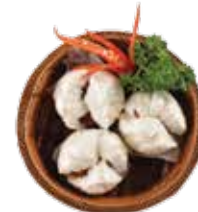
DS2 蜜汁叉烧包 $4 Hong Kong Char Siew Pau