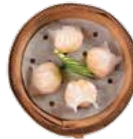
DS1 晶莹鲜虾饺 $4 Crystal Prawn Dumplings