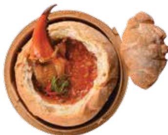
SB4 南洋辣椒螃蟹面包碗 Nanyang Chili Crab Bread Bowl _ $8